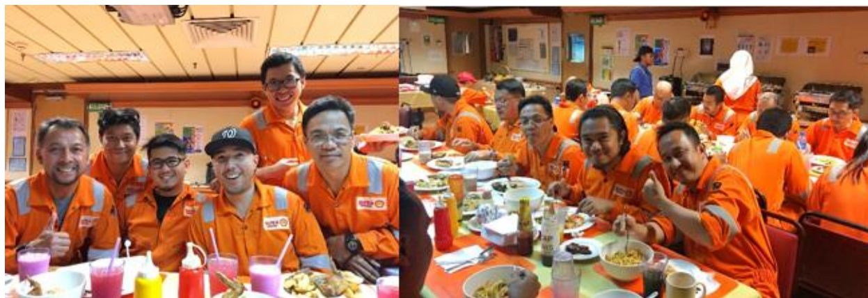
Staff enjoying their sungkai and performing their Terawih prayers

Ramadhan offshore is something truly special, despite being away from family, their favorite part of Ramadhan offshore is being able to Sungkai and Sahur with friends and colleagues, who are all part of one big family. Together, they live and work for the sake of their family and in some very real way, for the sake of all our families.