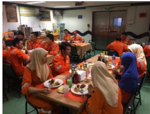
Staff enjoying Sungkai with friends and preparing for Terawih prayers

Currently, on the Ampa 9 platform, there has been an increase of critical activity due to the inspections and construction work ongoing to ensure asset integrity and process safety.