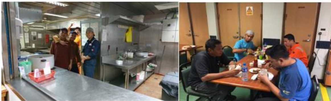
Caterers on Fairley 4 and staff enjoying Sahur

For caterers preparing meals for Sahur, their day starts as early as 2:00am to cater to the residents at their respective mess rooms or individual resting rooms. Daily toolbox talks are held either the night before or after Subuh prayers depending on the urgency and the type of work to be carried out.