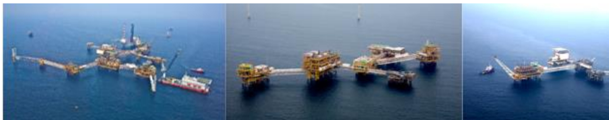
Champion-7, Ampa-9 and Fairley-4

Brunei Shell Petroleum Company Sdn Bhd (BSP), a Joint Venture between the Government of Brunei (50%) and a subsidiary of Royal Dutch Shell plc (50%), is the largest oil and gas company in Brunei. BSP explores, develops and produces crude oil and natural gas from 2 offshore assets and 1 onshore asset and on average, produces 300,000 barrels of oil equivalent per day (crude oil and natural gas combined).