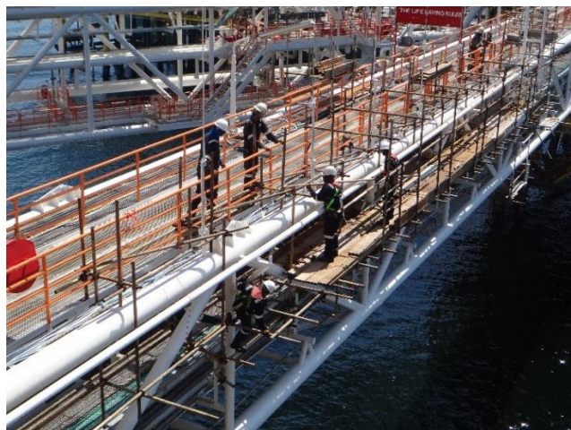
Contractors busy working on a platform

Morning shift hours are from 6:00 am to 6:00 pm but flexibility is available during Ramadhan, allowing individuals to take common breaks to rest when tired.