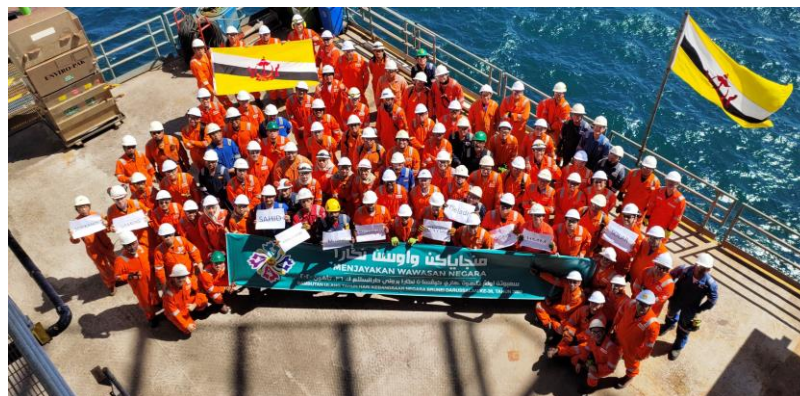
Champion 7 crew celebrate the National Day offshore