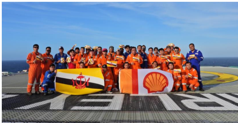
Crew of Brunei Shell Petroleum's Fairley 4 in a group photo