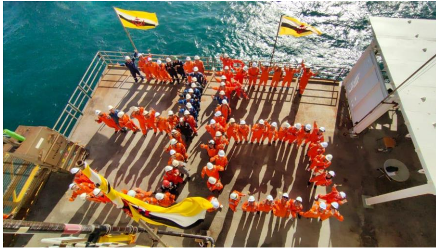
Crew of Brunei Shell Petroleum's Champion 7 in a group photo

Every year on February 23 rd , Bruneians across the country celebrate National Day with much passion and energy. While thousands gather in colourful and patriotic ensembles at Taman Haji Sir Muda Sultan Omar 'Ali Saifuddien, hundreds of BSP employees don their orange coveralls in the middle of the sea. The locations are different, but the intent is similar – to display their sense of pride and patriotism.